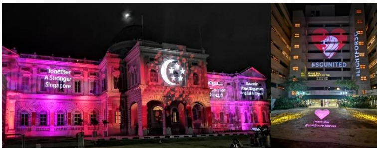
The company MJD Pro lit up hospitals and landmarks during the COVID-19 crisis with the LightforSG initiative. The company wanted to rally Singapore to cheer for our healthcare workers, using Symbols as reminders that we are all in this together. Pictured above are the National Museum of Singapore and Singapore General Hospital.