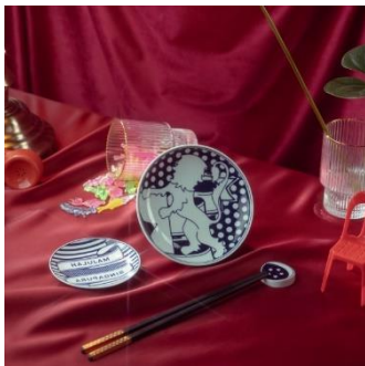
MCCY collaborated with local designers and businesses for the 1959 campaign, which sought to celebrate the 60 th anniversary of the Symbols in December 2019. Elements of the Symbols were featured on everyday items like badges, homeware, and attire.