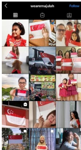
To celebrate Labour Day amidst a nationwide lockdown in May 2020, ground-up group We Are Majulah called on Singaporeans to proudly display their Flags from their homes in support of all workers, particularly essential workers. Singaporeans joined the “Labour of Love” movement by posting a picture of their flags on social media.